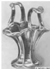
2800/138 - 9½" 2-handled Basket Height 9½", Length 7¼", Width 7¼"