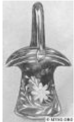
No. 59 - Handled Basket made from #59 12" Vase, Cut 2010