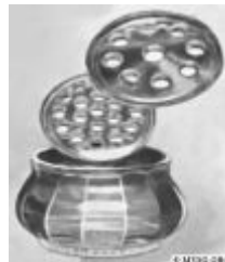
2863½ - 3-piece Flower Center, Optic