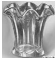
2800/120 - 6" Sweet Pea Vase, Scalloped Edge Height 6", Top Width 7½", Bottom Width 4½"