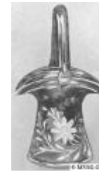
Cut 2010 View Examples