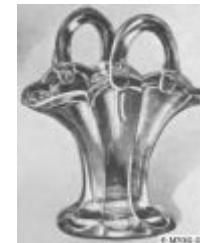
2800/134 - 9" 2-handled Basket Height 9", Length 7¾", Width 5"