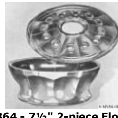
2864 - 7½" 2-piece Flower Centre, Cut Bottom