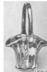
2800/124 - 9" Basket, Cut 2015 Height 9", Length 6", Width 3¾"