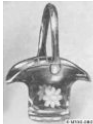
082 - Handled Basket, Cut 852