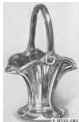
2800/135 - 12½" Basket Height 12½", Length 8", Width 5"